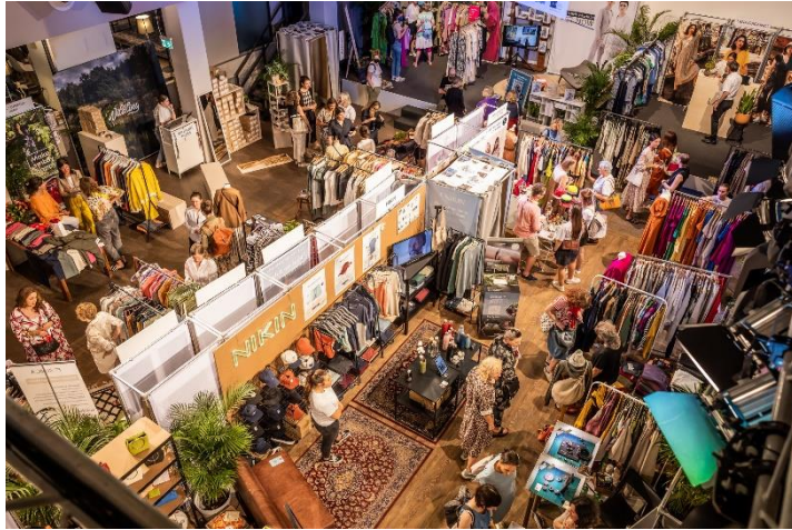
Neonyt Lab, 24 to 26 June 2022, Union Halle, Frankfurt am Main