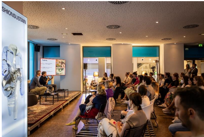
Fashionsustain, 24 to 26 June 2022, Union Halle, Frankfurt am Main